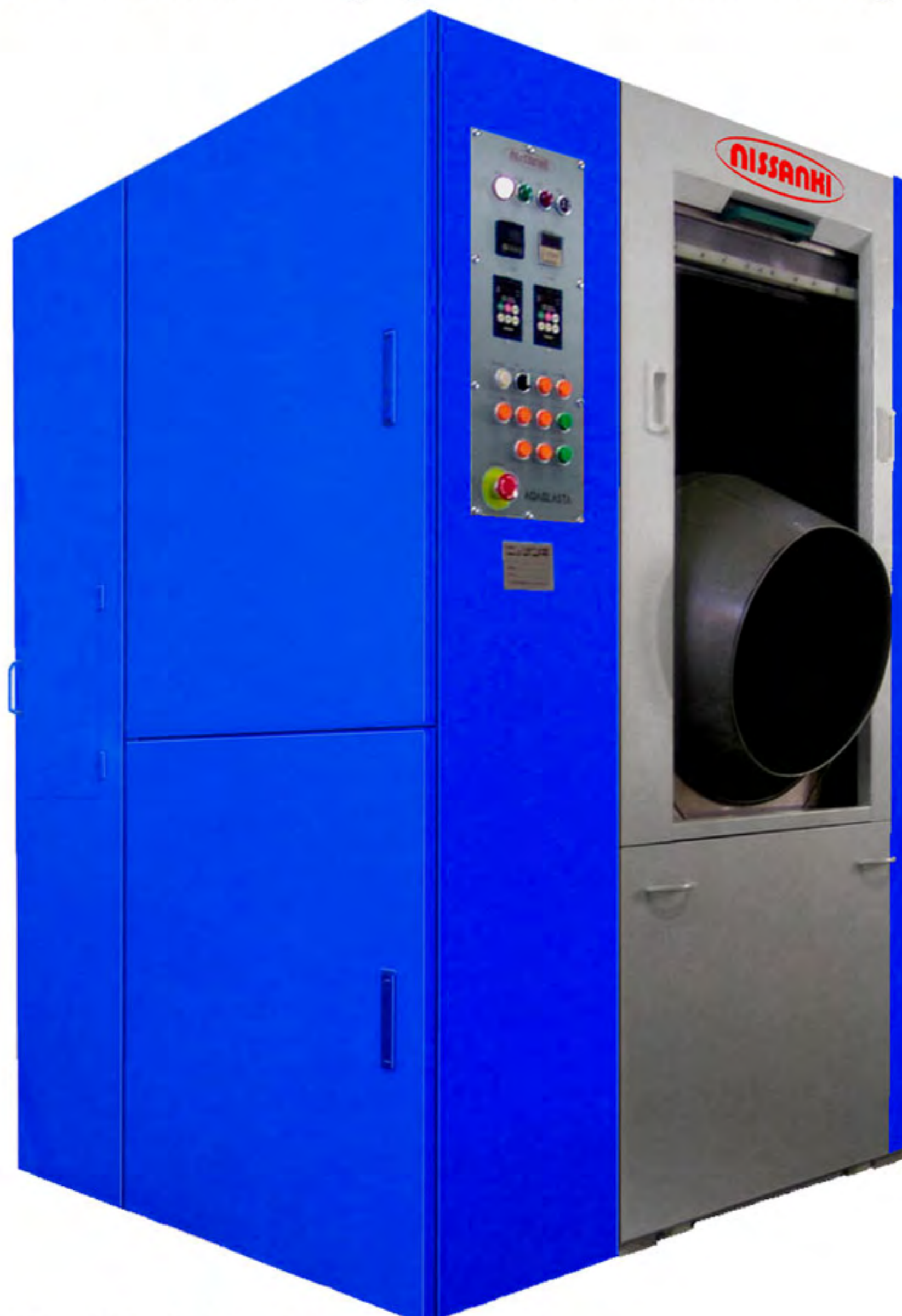
AQB-SB40 ( 40 little )

AQABLASTA is easy operation and wide using wet blasting machine